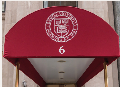
No need for a taxi. We are within walking distance of Grand Central Terminal, Penn Station, and most subway lines.