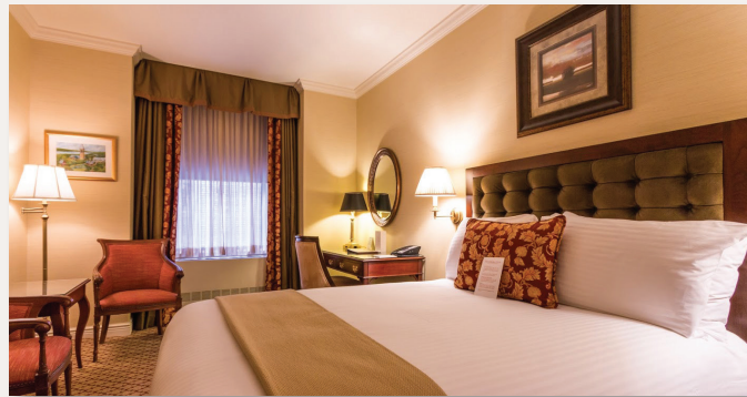
An overnight stay includes complimentary use of the Health & Fitness Center and breakfast buffet in the Cayuga Dining Room.