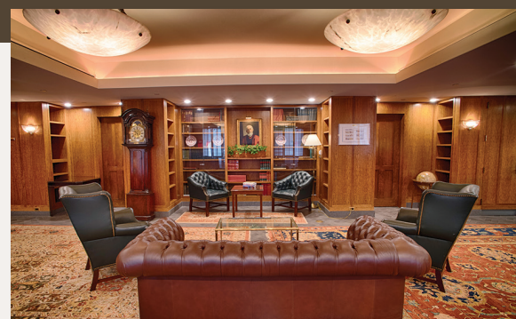
Work, study, relax in the common areas of The Club.