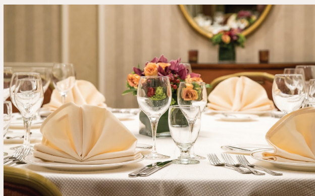
With over 20 years of experience, the Meeting and Events team will make your professional or social event one to remember!